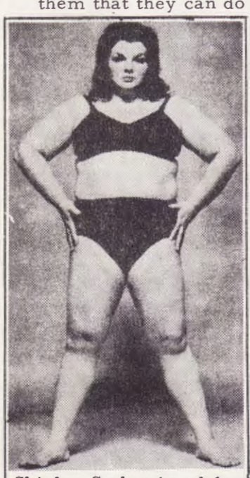
Shirley Stoler in ad for ''Honeymoon Killers''

SS: Yes. Wear yourself as if you are beautiful, and you will be beautiful. Play the game, even if you don't believe it at first. Little by little, it's going to happen. Get to become your own friend. Get to like yourself. Stop thinking, "FAT!" Just think, "PERSON", "WOMAN", (or "MAN"), and that's about it. You have to make your own miracle! NAAFA can show them that they can do it, but NAAFA can't do it