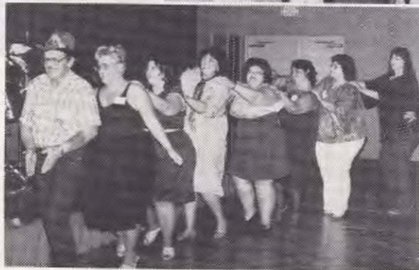
The Ohio "Conga Line" at Friday night's party